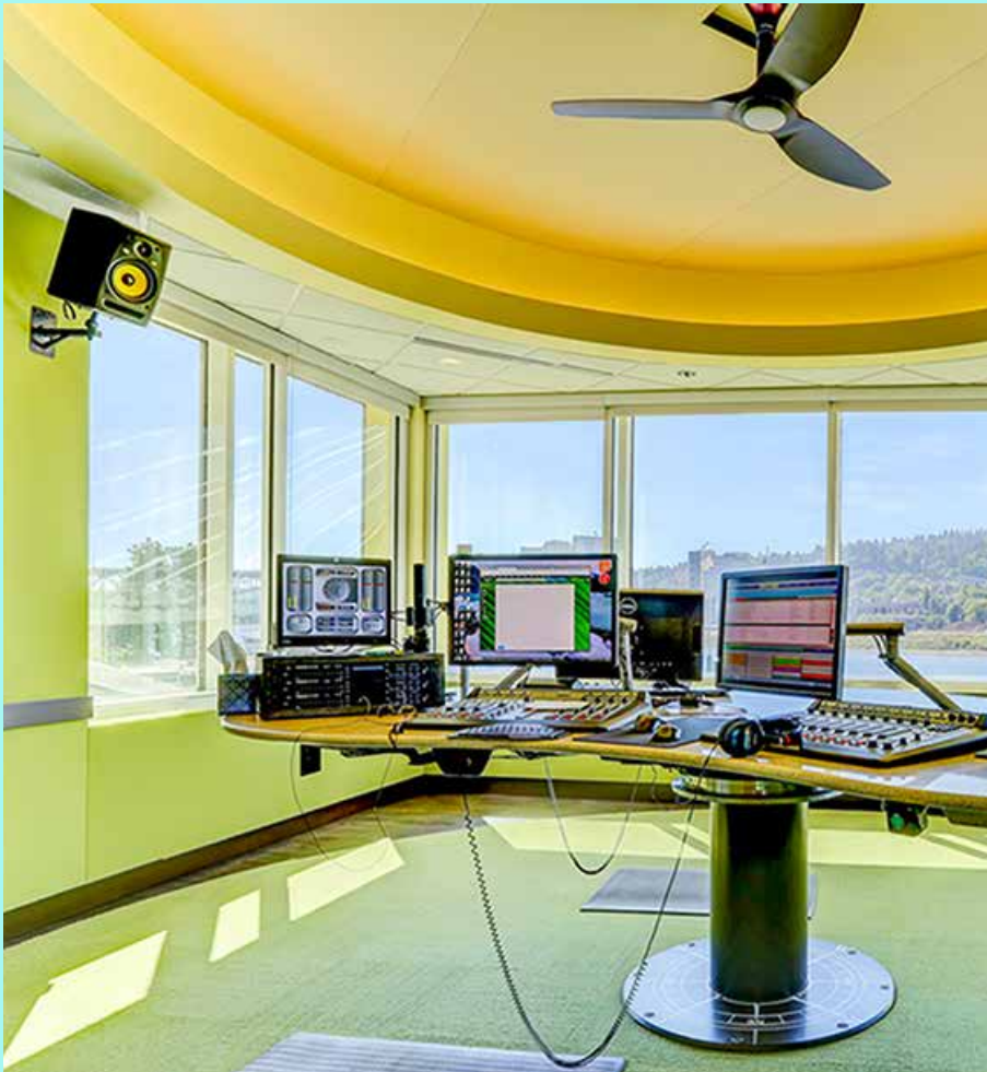
The All Classical Portland On-Air Observatory Studio in Portland, Oregon