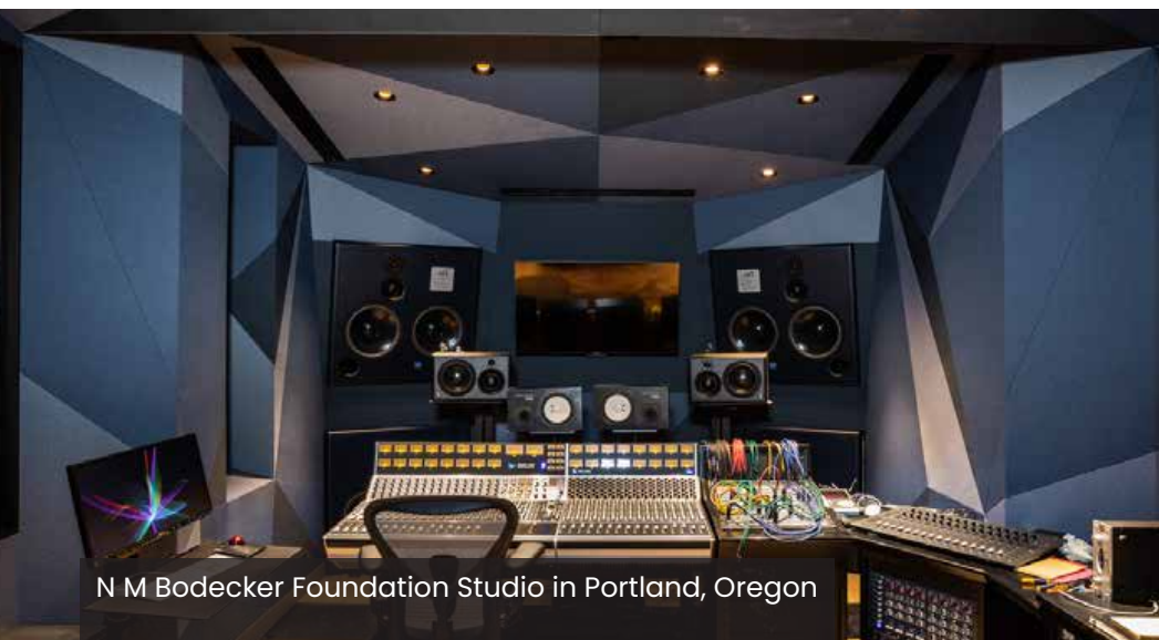
N M Bodecker Foundation Studio in Portland, Oregon