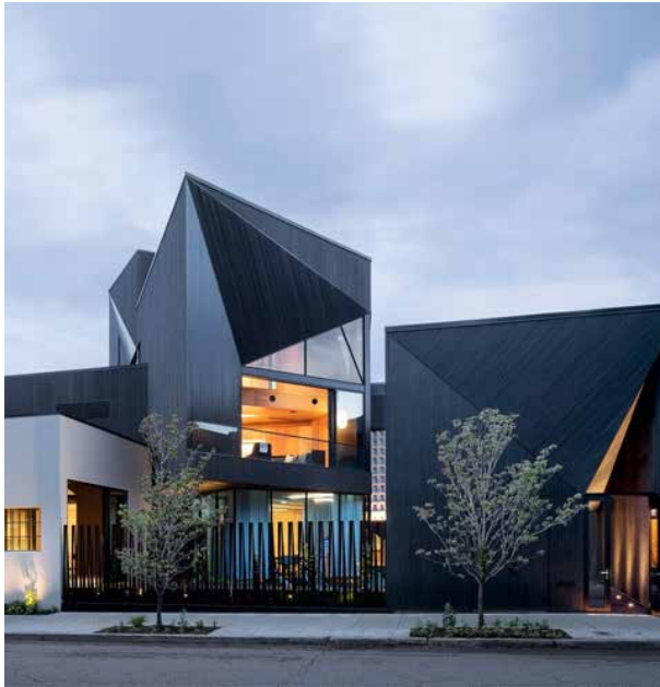
N M Bodecker Foundation Studio in Portland, Oregon

Call for Nominations. All Classical Portland challenges listeners, Pacific Northwest artists, and performing arts organizations to nominate musical works by underrepresented classical composers to be recorded and published through the Recording Inclusivity Initiative.